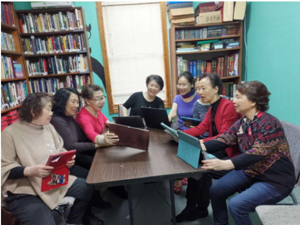
Beside: Durham Foreveryoung Activity Centre, adopting new technology/approaches for improving the services for seniors.